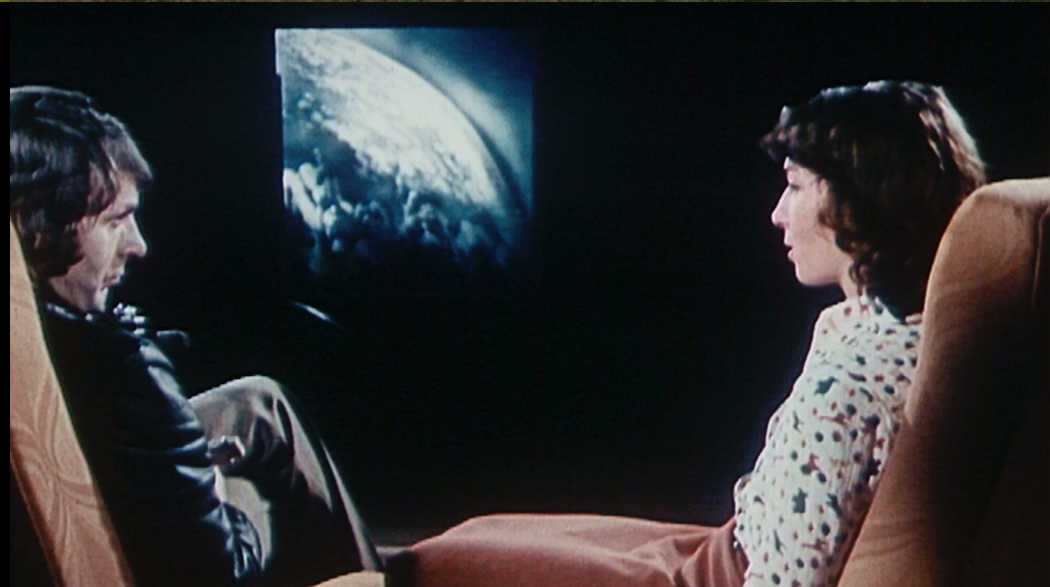
Stills from Silicon Saxony: The Voice Over narrator observes today's construction site and gets drawn into a spiraling sequence of images, dreams and desires projected onto the computer chip in the socialist past.